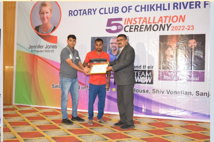
FELICITATION OF STAFFS WATERING TREES ALONG CHIKHLI KHERGAM ROAD