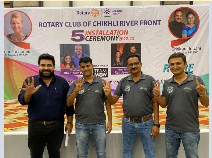
PRESIDENTS & SECRETARIES BEST OF LUCK TEAM WOW