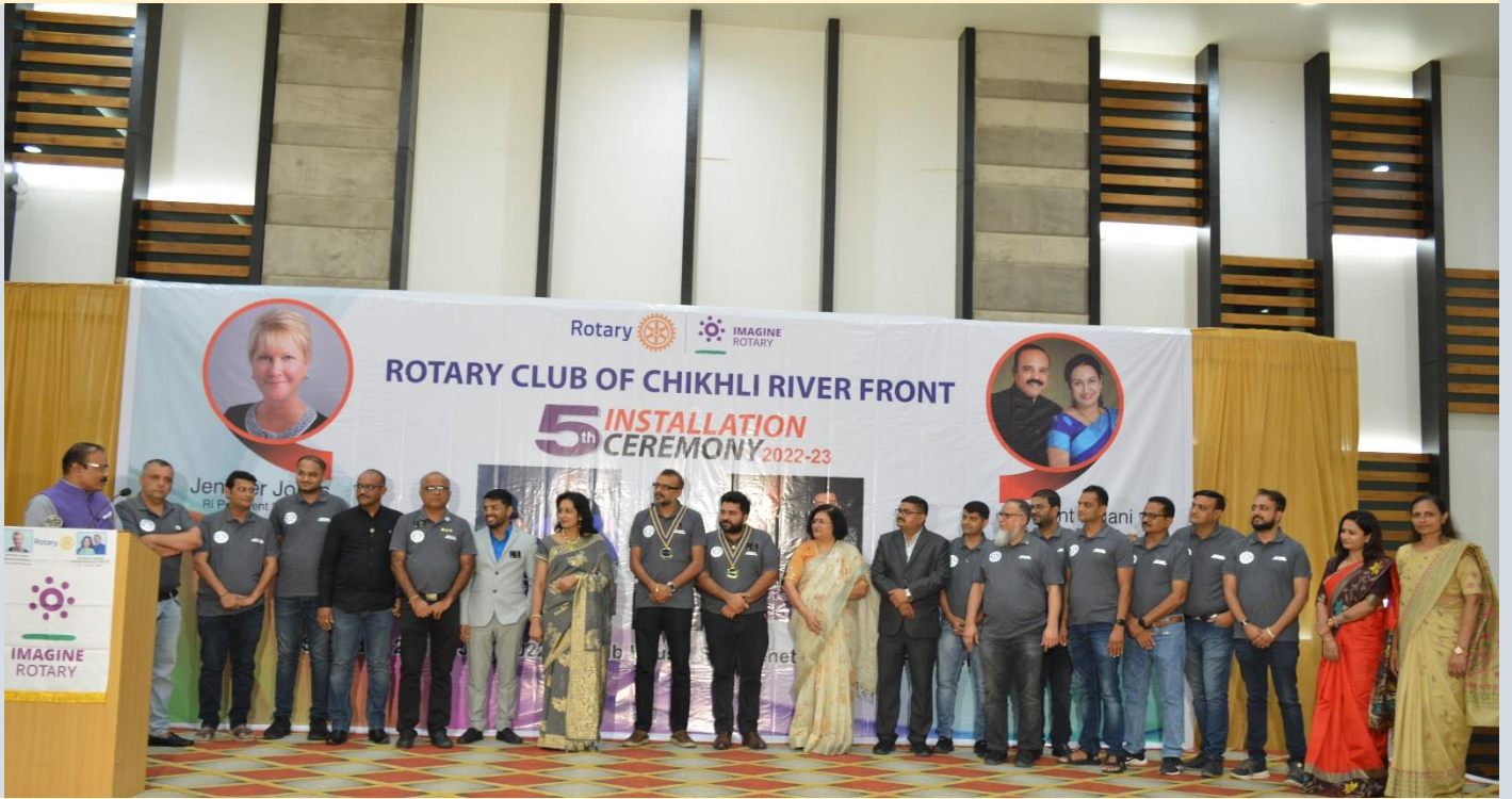
OATH( ABOVE)- GROUP PIC(BELOW)BEST OF LUCK TEAM WOW